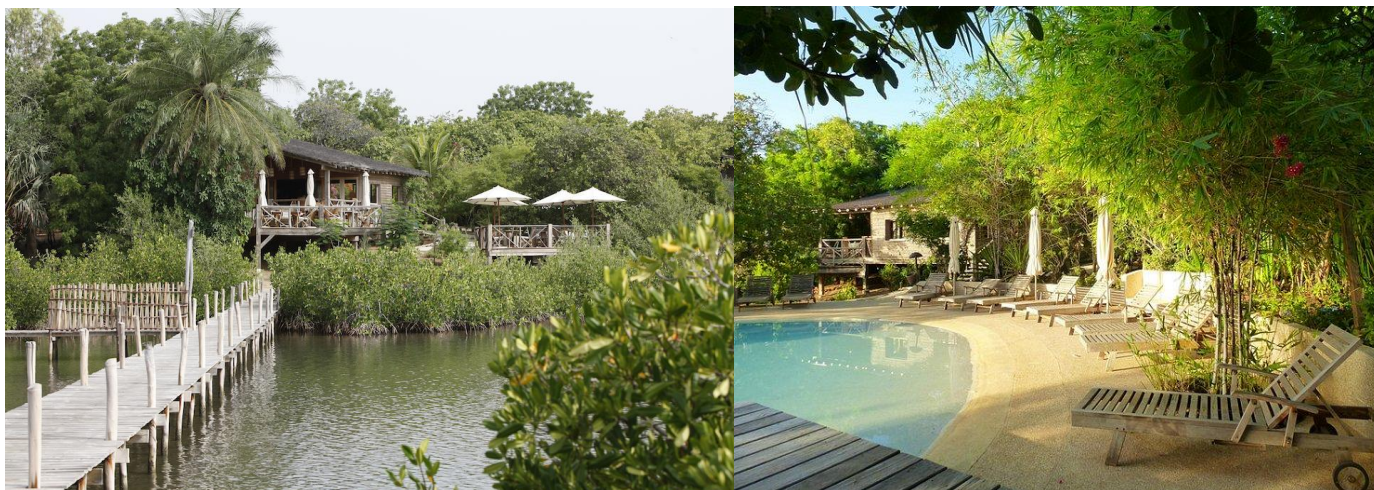
HOTEL SOUIMANGA LODGE